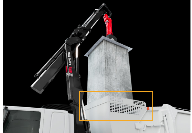
Underground container can only be opened within the safety zone, as illustrated here.

SAM combines the advantages of CTC and SAF with new innovations for added efficiency and protection. For example, in addition to a memorized trajectory for the underground containers that protects your equipment, the system also prevents waste from being unloaded outside of a defined "safety zone."