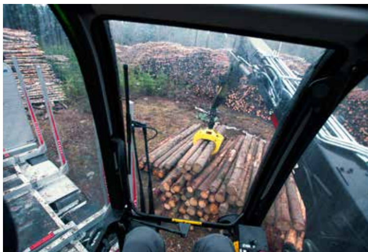
Gain panoramic views with Hi-Vis.

Incredibly tough, the shockproof front door is OPS tested for ISO 8084:2003 standard, and greatly reduces the risk of injury if anything impacts the door.